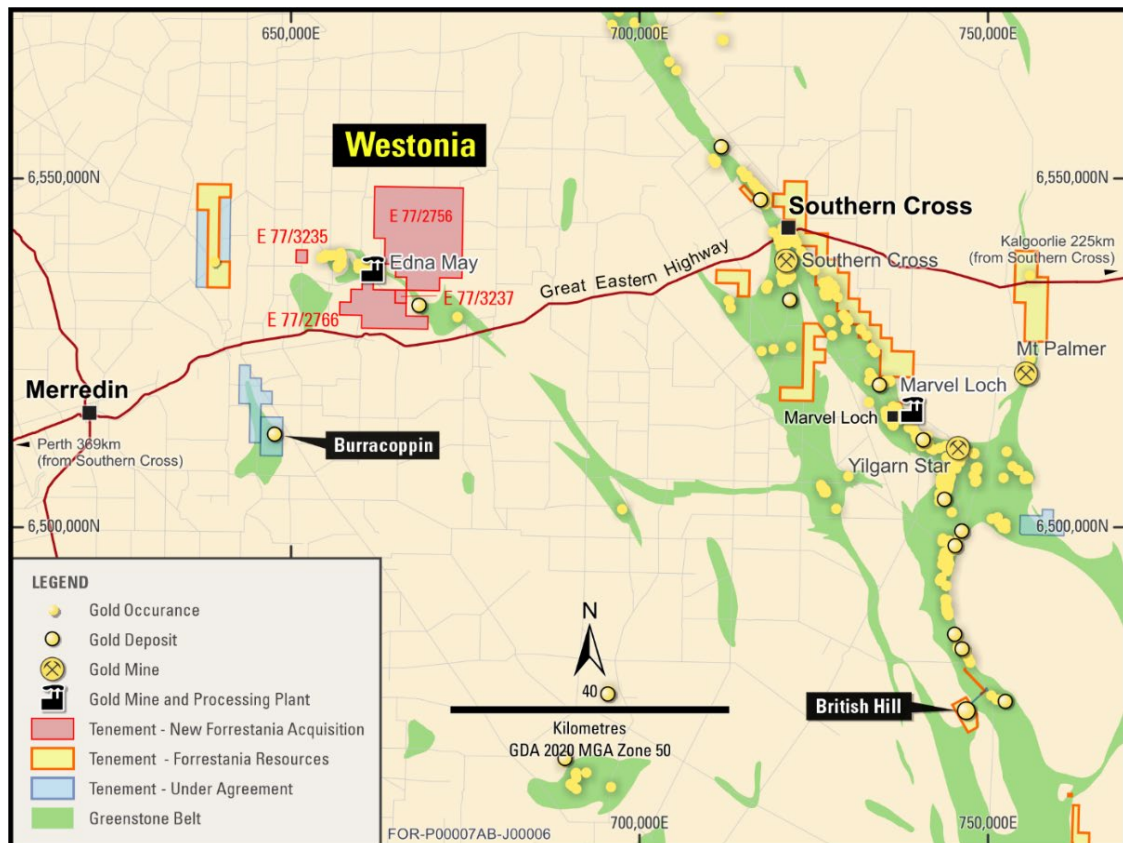
Figure 1. Tenure map south of Southern Cross