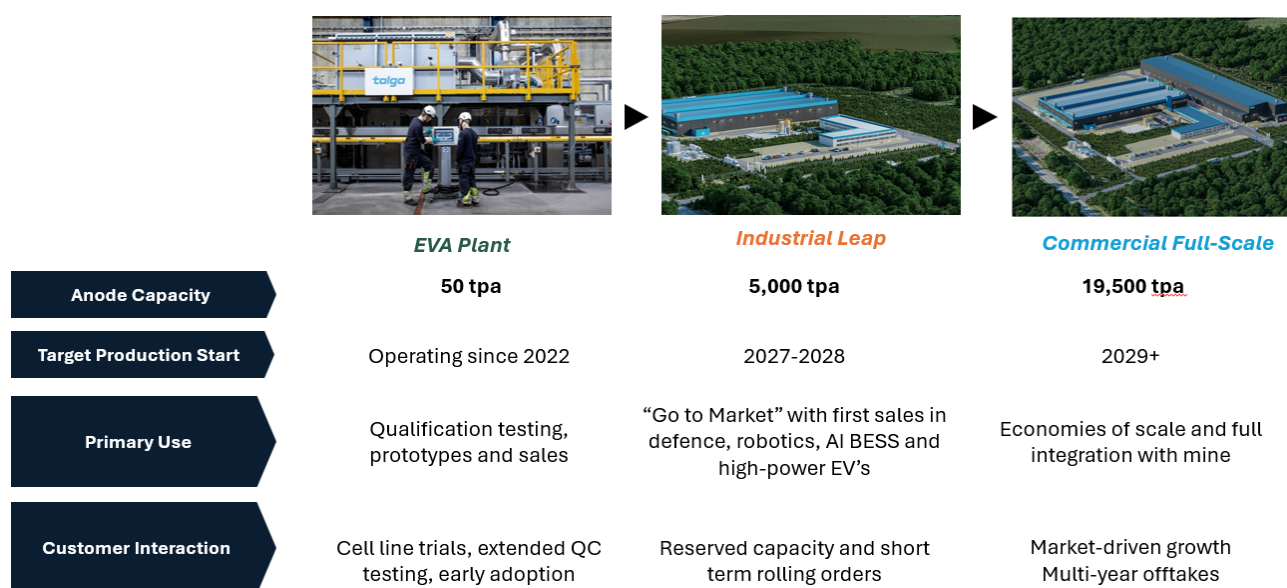
Graphic: Talga's proposed staged scale-up to commercial graphite anode production

The staged 5,000 tpa approach delivers material strategic advantages: it captures a substantial portion of overall construction and site establishment costs, materially reduces future capital requirements for full ramp-up and mitigates execution risk. This de-risked pathway positions the Company for a Final Investment Decision (FID) following FEED completion and supports phased, lower-risk growth to full commercial scale.