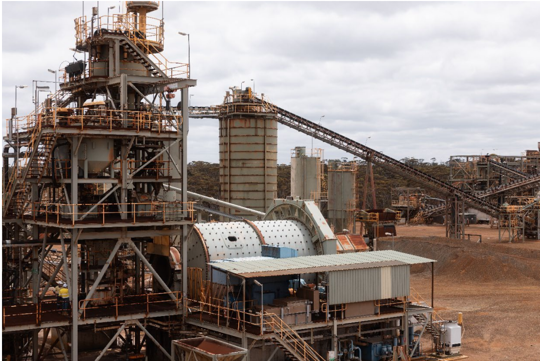
Figure 1 – Final plant inspection with ECI team of Como Engineering, Polaris Engineering, OTOC Australia and MBS Environmental

This announcement has been authorised for release by Forrestania Resources' Board.