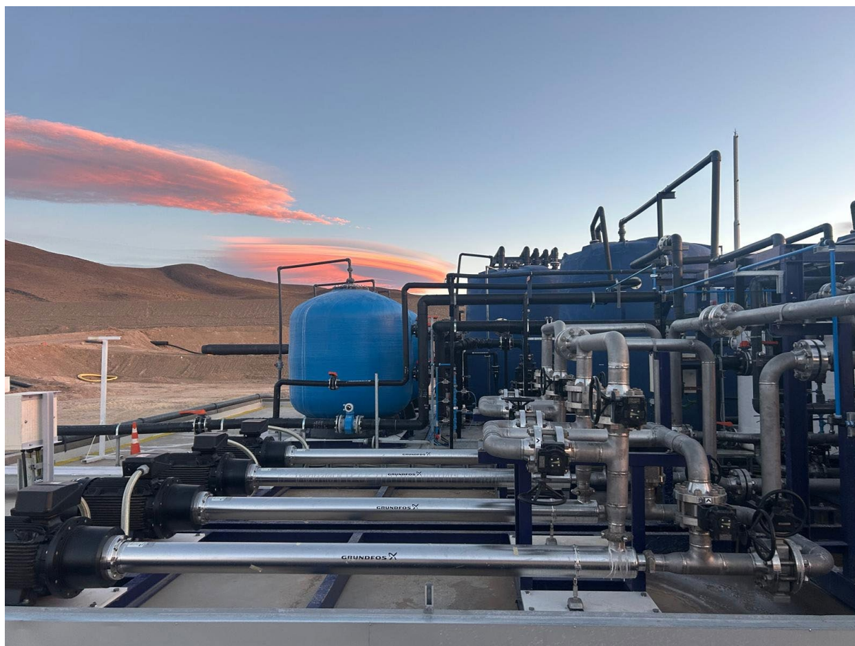
Figure 2. HMW nanofiltration plant in operation.

Galan has accumulated a brine inventory of circa 10,000 t LCE in its evaporation ponds at HMW, providing immediate and substantial feedstock for the production ramp-up phase. This inventory positions the Company to build towards rates of production consistent with the initial Phase 1 production capacity of 4 ktpa LCE without interruption. Pond construction works for the expanded 5.2 ktpa LCE Phase 1 will commence shortly, with the capacity uplift targeted for H1 2027. The nanofiltration plant has been designed with flexibility to support this expanded potential rate of production.