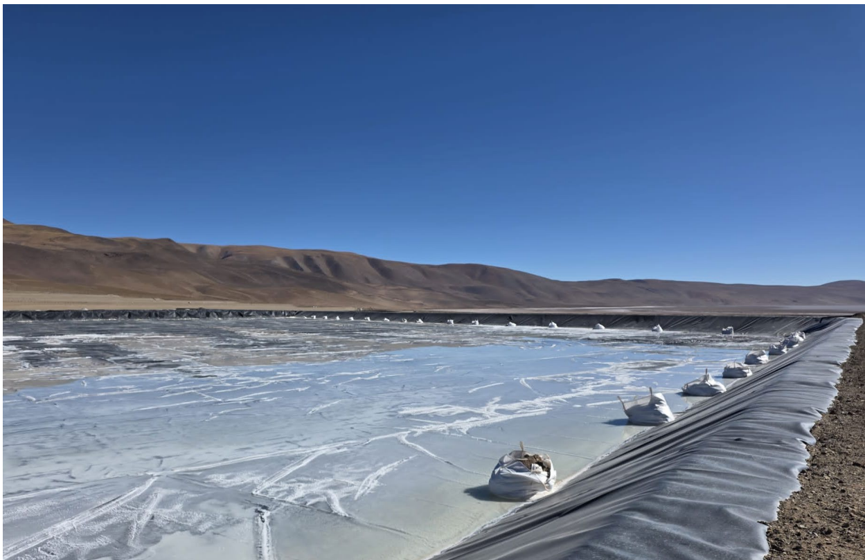
Figure 1. Processed brine discharged into final evaporation pond.