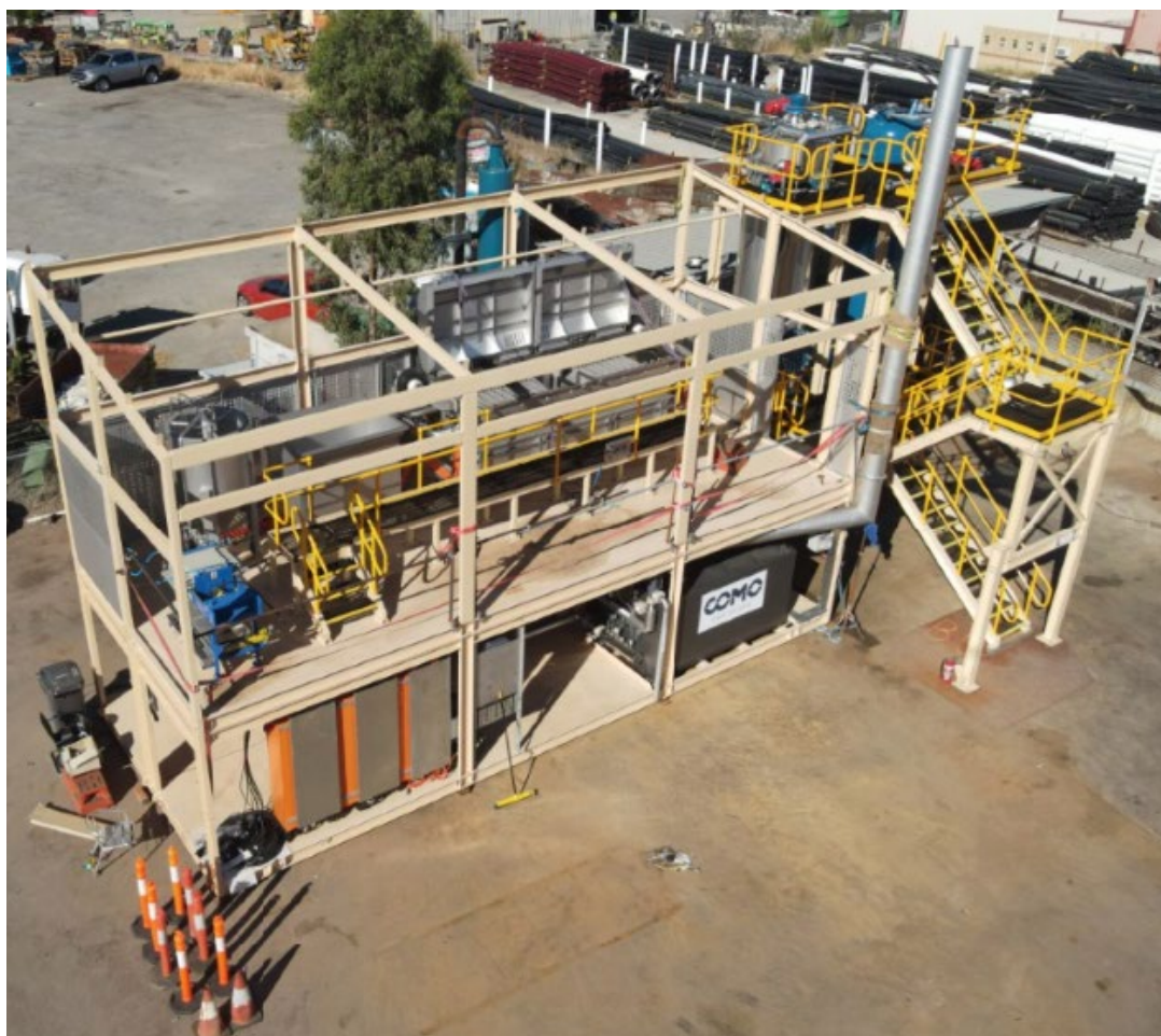
Figure 2 Example of a 3.0 tonne modular Pressure Zadra Elution Plant assembled at Como for Shop Testing

Forrestania Resources Limited (ASX: FRS) (“FRS” or “the Company”) is pleased to announce that it has engaged Como Engineers for its ready-to-operate modular Elution and Carbon Regeneration Plant, inclusive of Gold Room equipment.