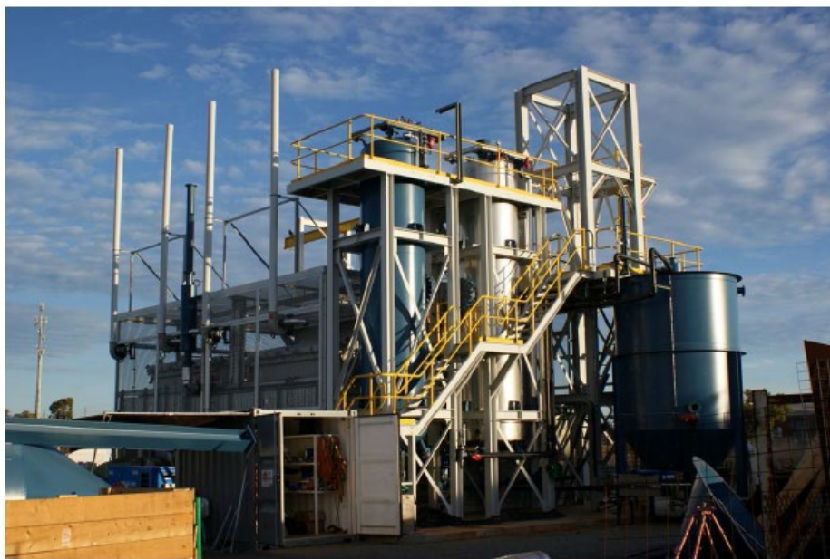
Figure 1 Example of a 6.0 tonne modular Pressure Zadra Elution Plant assembled at Como for Shop Testing